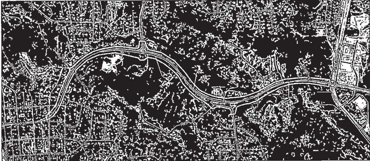
Figure 1. Survey & Mapping Limits

Deliverables: Design Survey & ROW mapping, Legal Descriptions and Exhibits, CDOT Right-of-Way Plans, Right of Entry Agreements, Land Survey Control Diagram