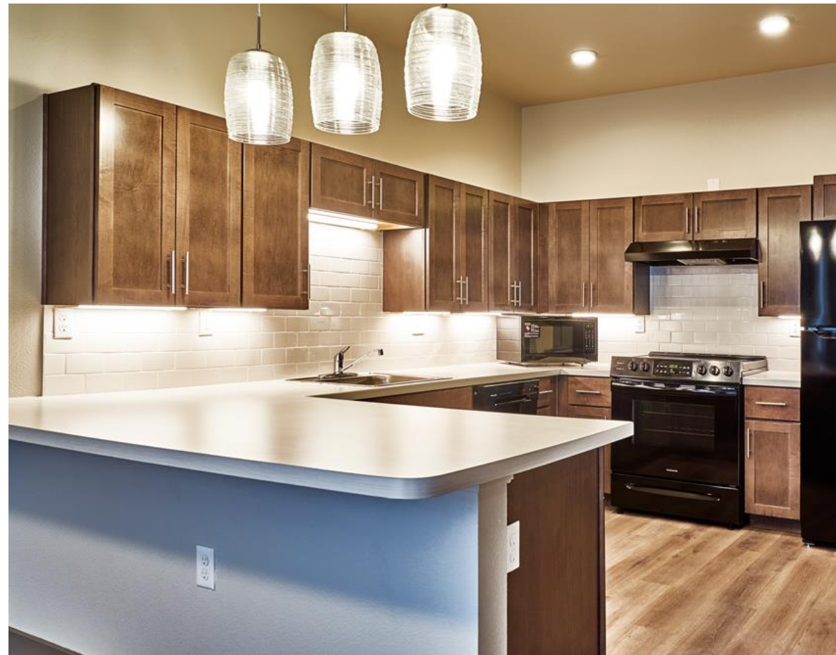
DCHP Owned and Operated Oakwood Senior II Apartments Castle Rock

DCHP is involved with additional affordable units that are under construction or coming soon