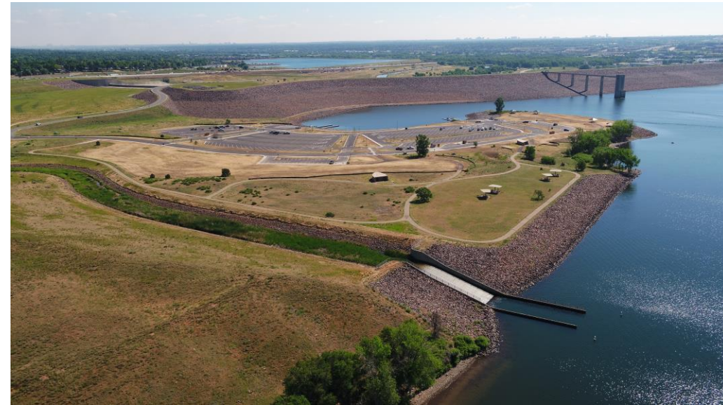
Aerial view of Chatfield Reservoir looking east