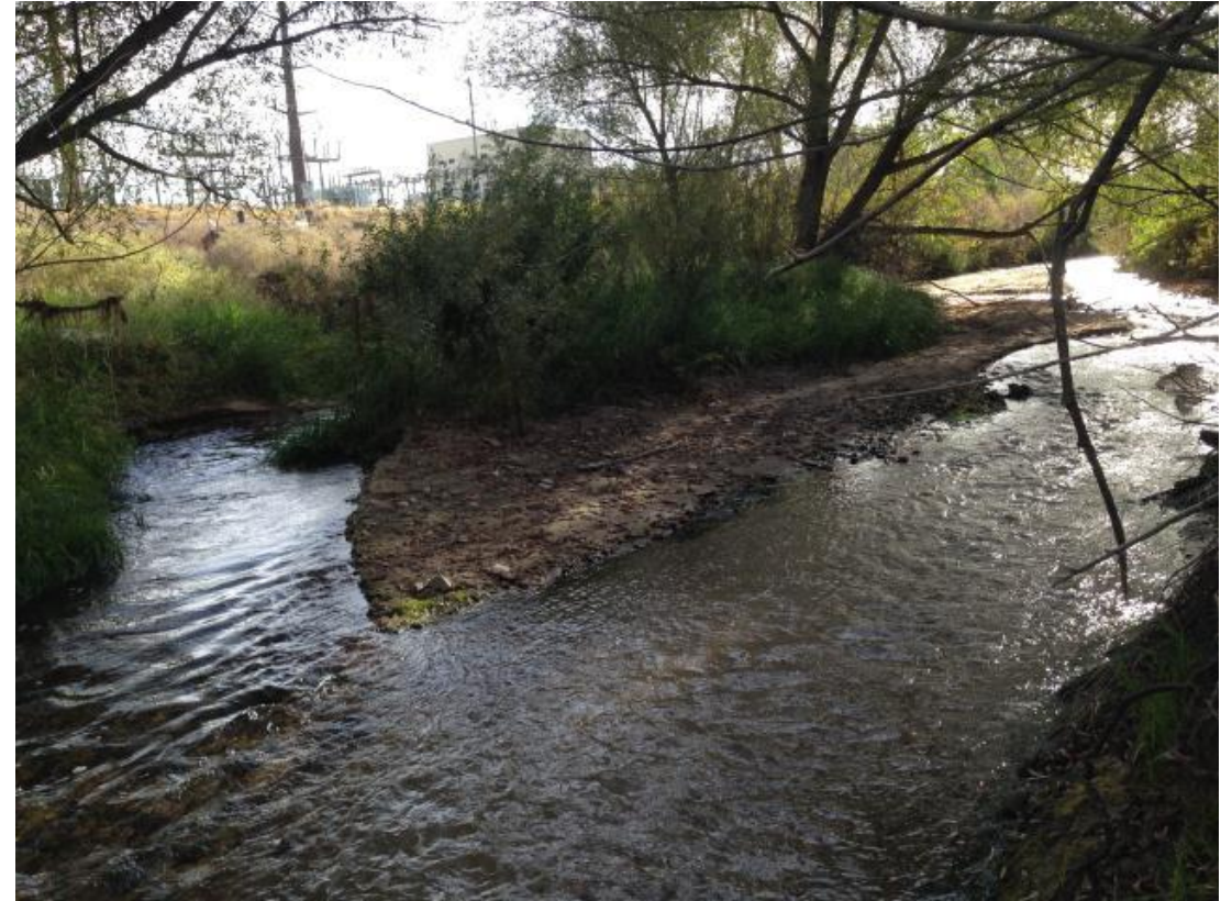
Town's reusable effluent water entering East Plum Creek