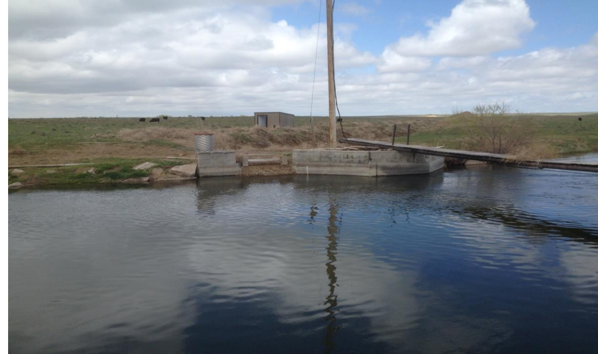
Diversion from Riverside Canal to Rothe Recharge basins