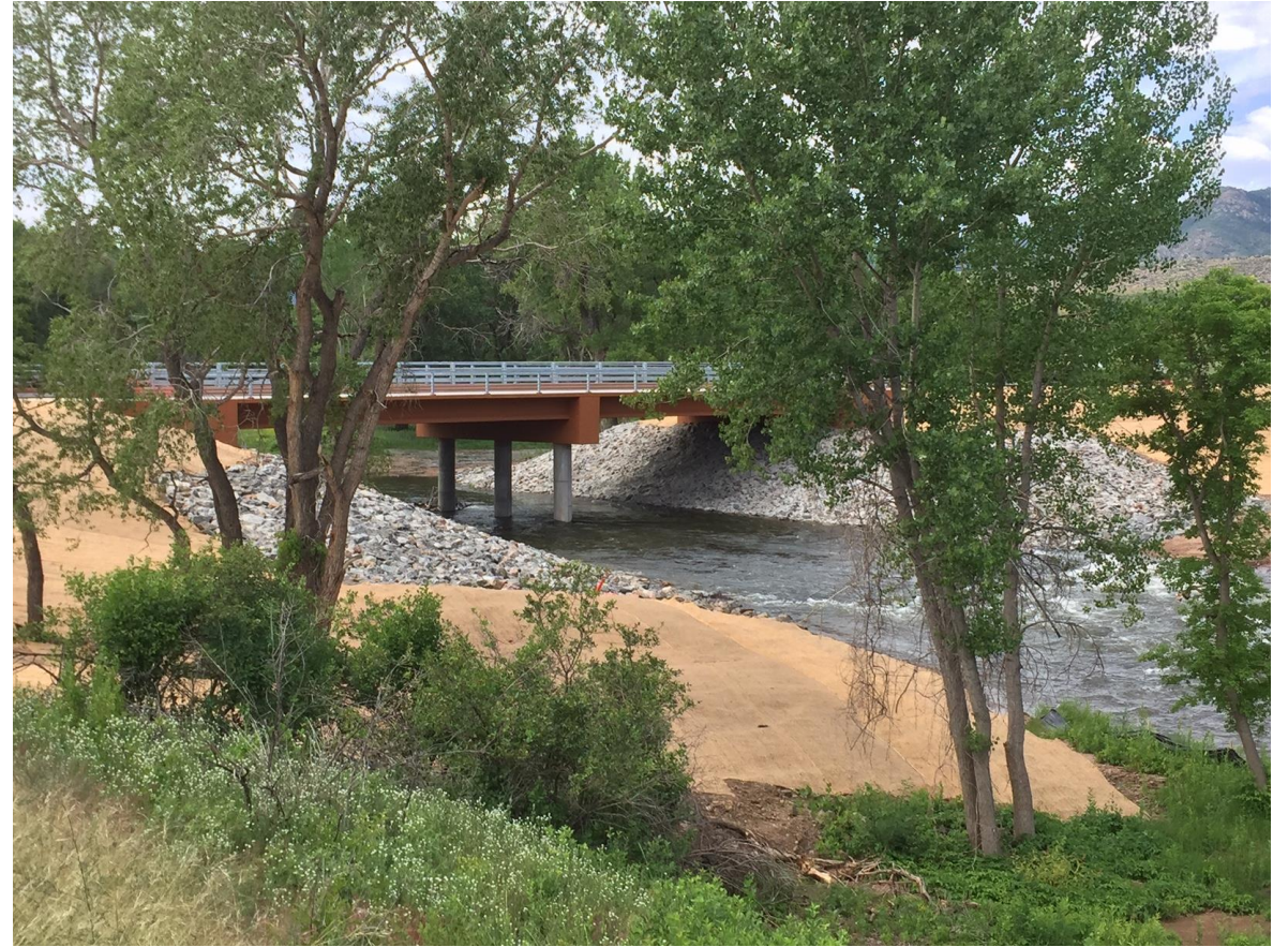
Bridge over South Platte River within Chatfield State Park