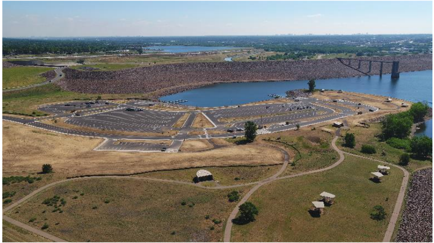
Reconstructed North Boat Ramp area