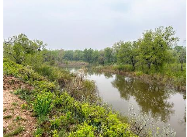
South Platte River just upstream of Chatfield