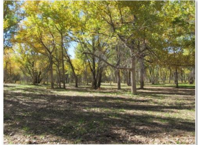
Stands of Cottonwood trees along the Plum Creek arm of Chatfield