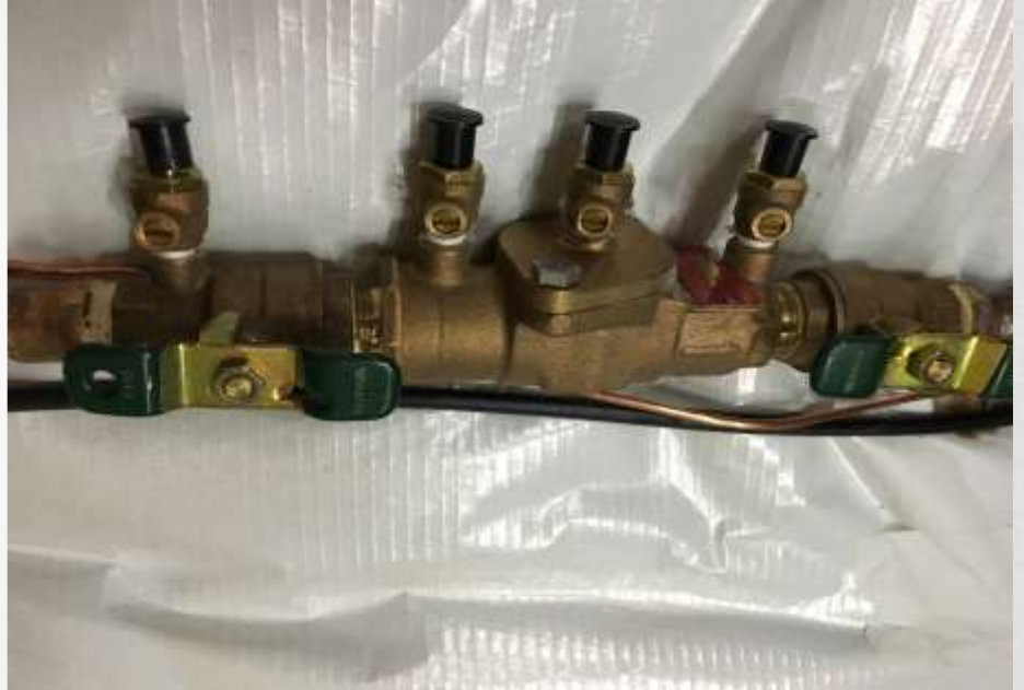
Double Check Assembly Residential Application