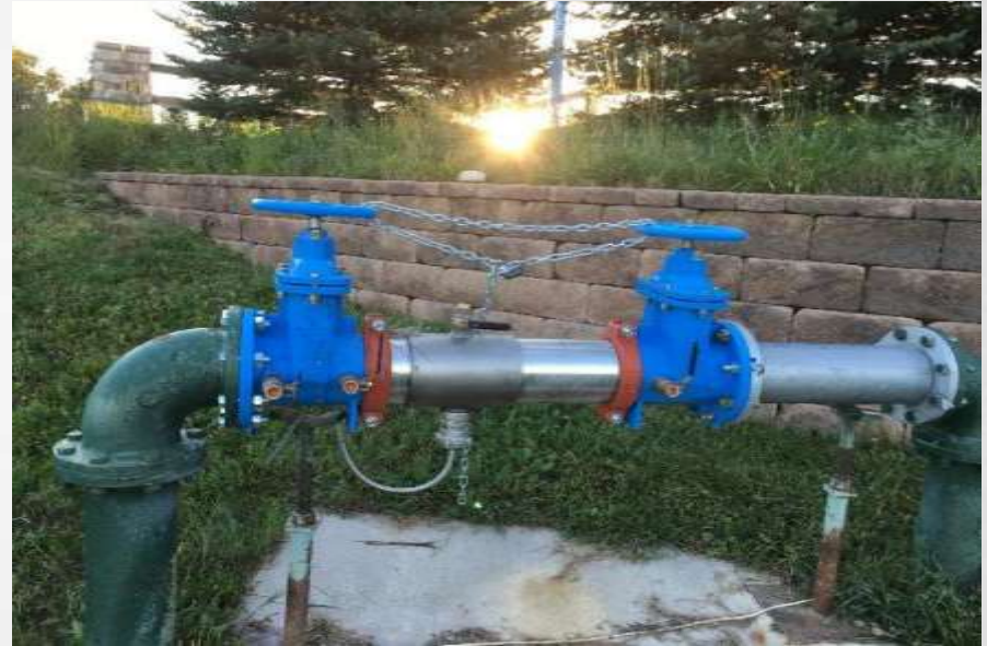
Reduced Pressure Zone Assembly Irrigation Application