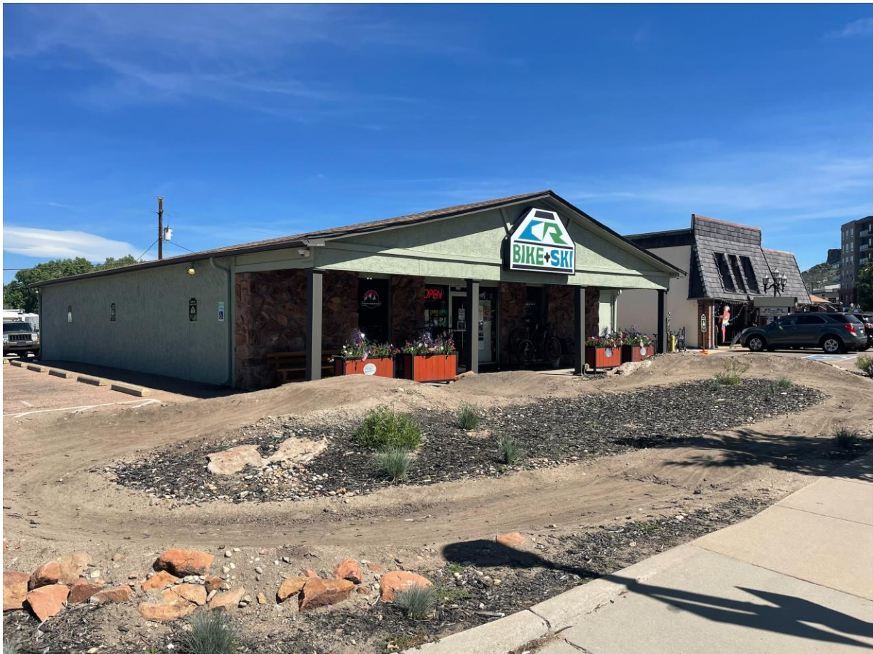
Figure 2: Existing Building

The building is a one-story commercial structure with stucco-clad exterior walls, stone veneer accents, and a low-pitched gabled roof. The front elevation includes a projecting covered entry/porch canopy, supported by square posts, that creates a sheltered walkway beneath the main gable. The side elevation presents a long, largely uninterrupted wall plane that is proposed to receive the mural treatment.