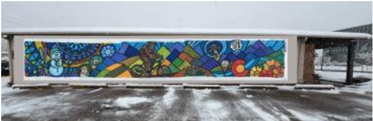
Figure 3: Proposed Mural