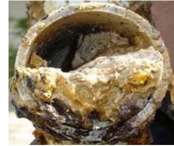
Sewer Line Clogged with Fats, Oils & Grease (FOG)