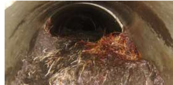
Sewer Line Clogged with Tree Roots