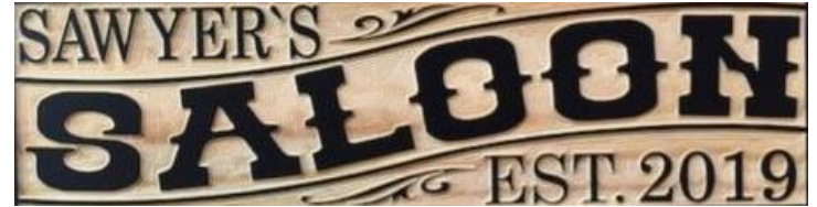
2 FOOT BY 5 FOOT SIGN WITH OLD WEST SALOON STYLE FONT SANDBLASTED REDWOOD