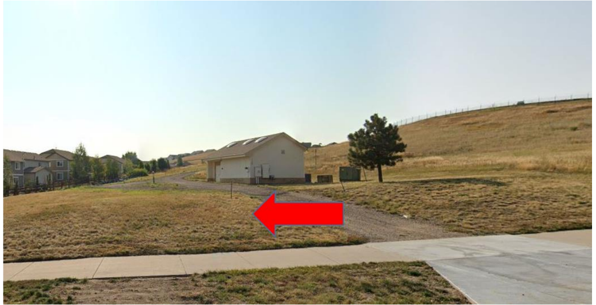
SIGN LOCATION WEST OF DRIVEWAY