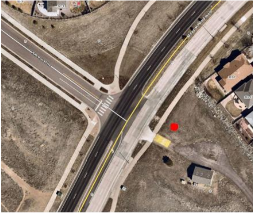
BLUE ZONE PUMP STATION, 1760 MEADOWS BLVD