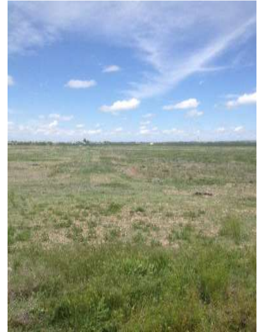
The Town's Rothe Property in Weld County