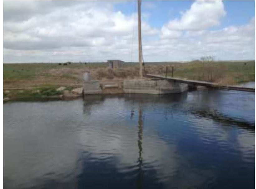
Riverside Diversion which feeds the Rothe/Sublette Recharge Project