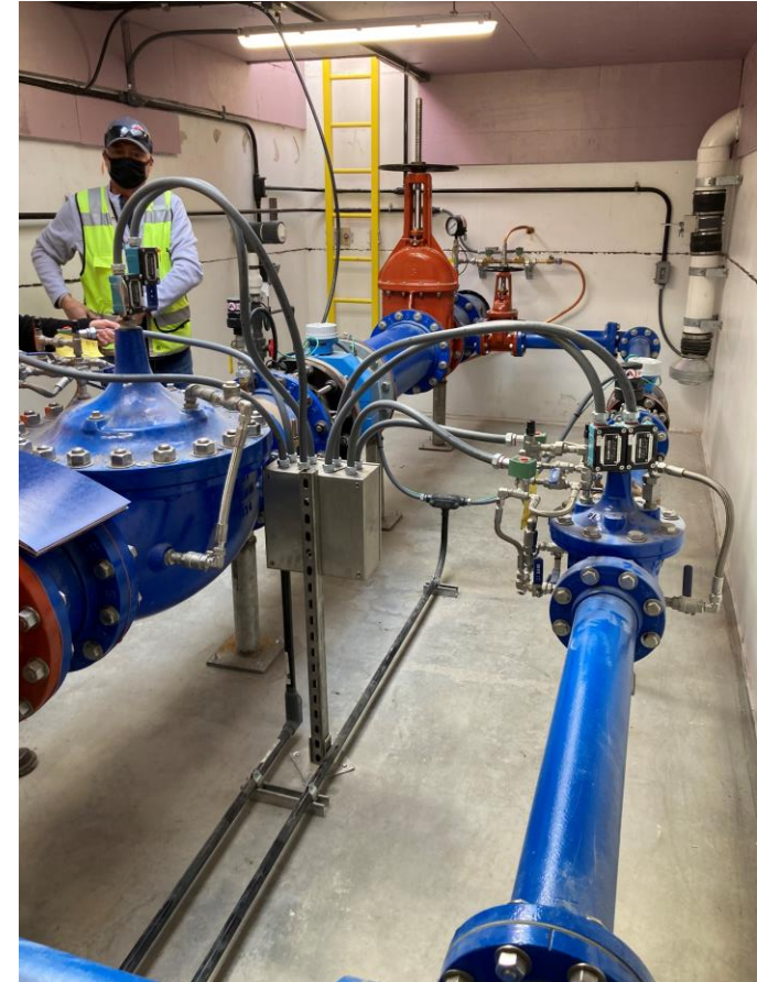
Interior of the Castle Rock to Dominion metering vault