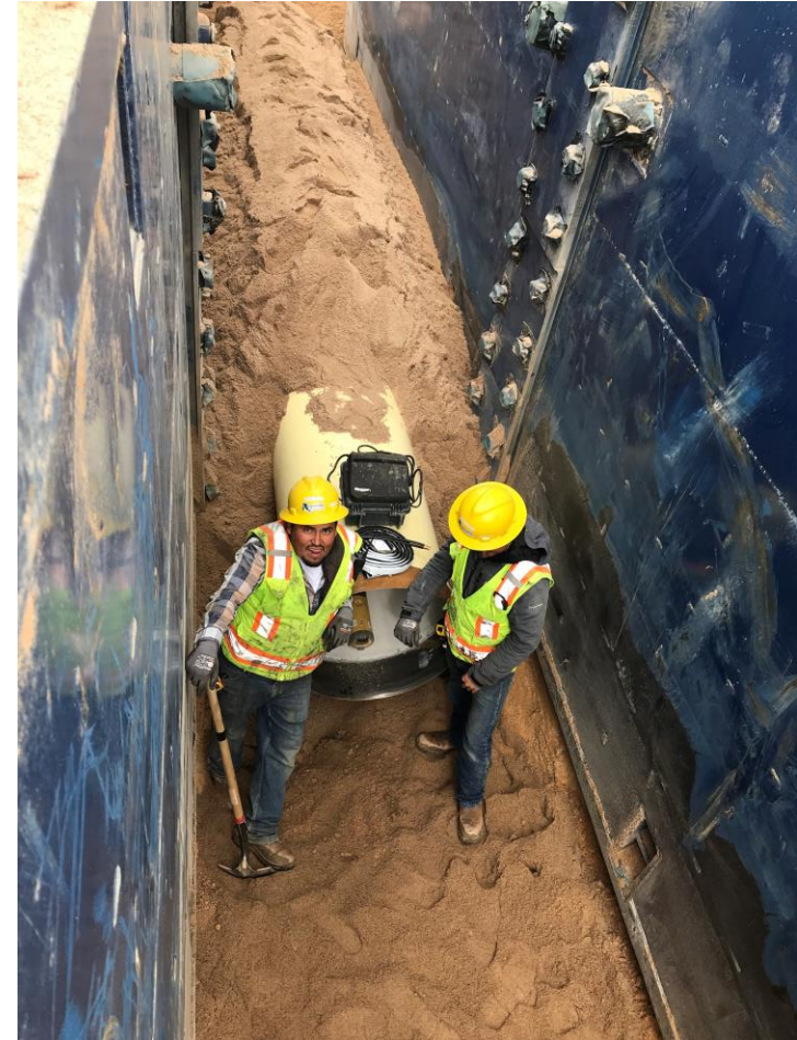
Construction activities during the installation of Dominion's Eastern Regional Pipeline