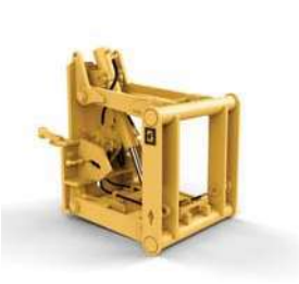
BALDERSON™ LIFT GROUP