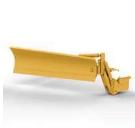
MASTLESS SNOW WING