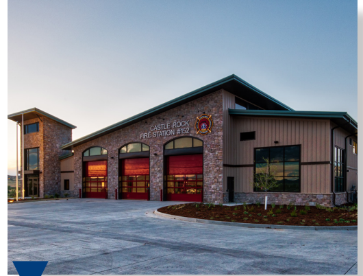
Fire Station 152