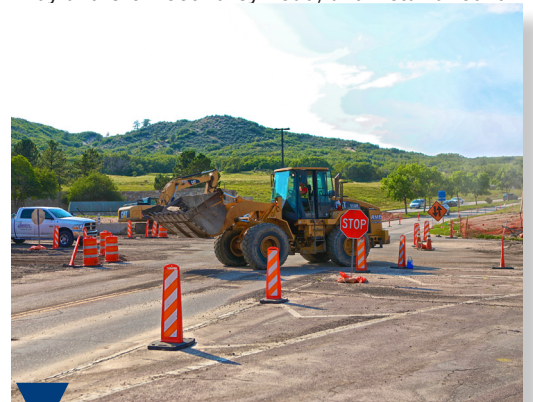
Wolfensberger/Plum Creek roundabout