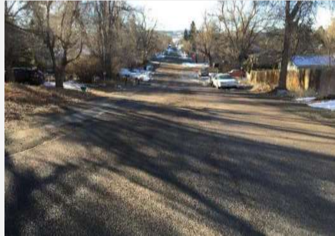
Cantril Street looking south towards Fifth Street