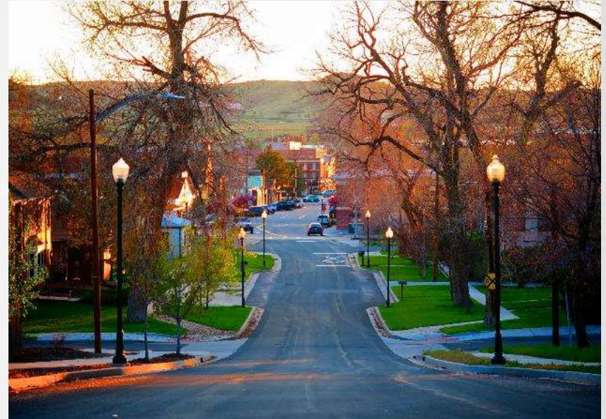
2007 Completed Project Improvements: Third Street looking west toward Downtown