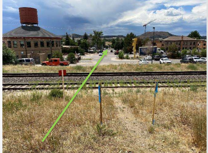
Storm Sewer Outfall Alignment at Sixth Street