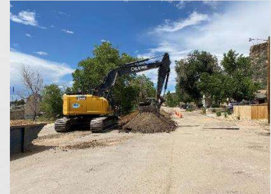
Installing Water in Front Street