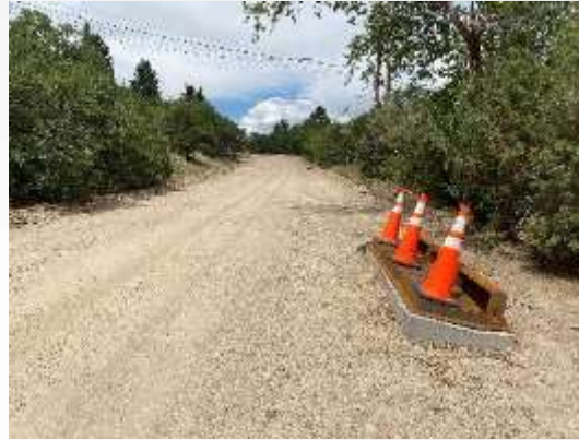
New Storm Drain Inlets on Gilbert Street