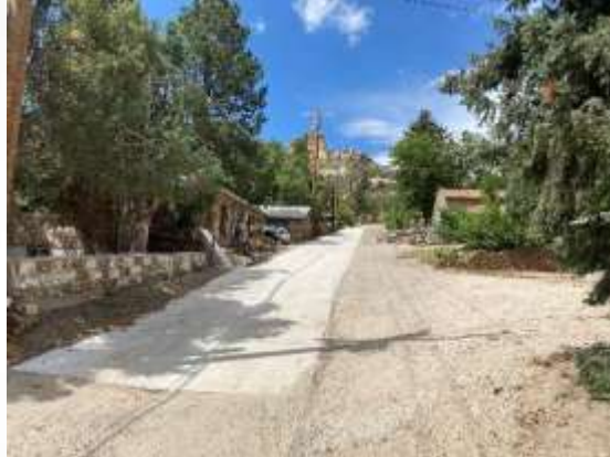
Completed Alley Paving between Cantril and Lewis Street