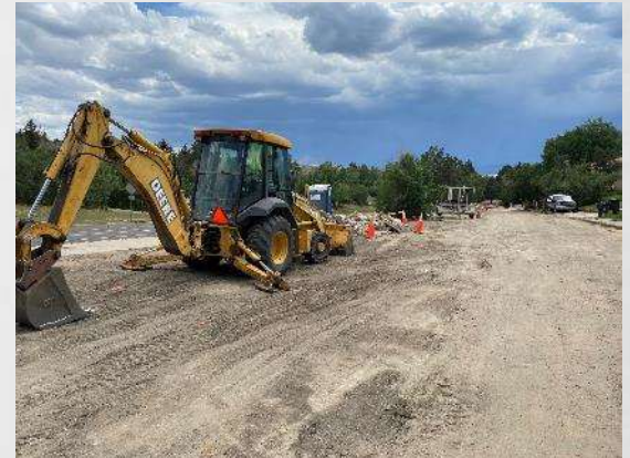
Dry Utility Relocations on Anderson Street