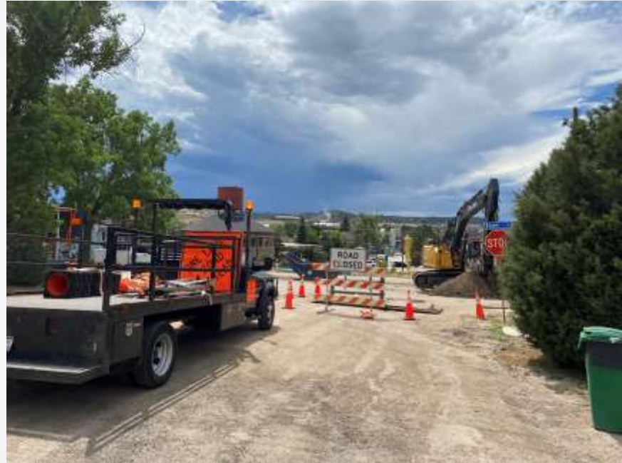
Temporary road closure during construction