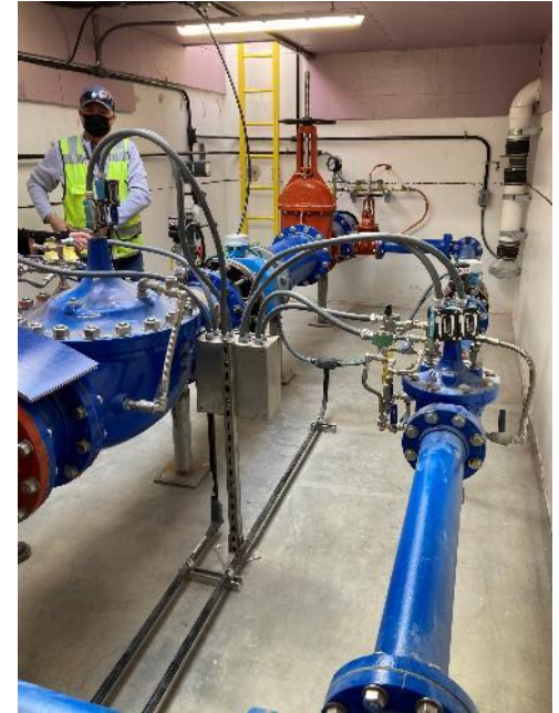
Interior of the Castle Rock to Dominion metering vault