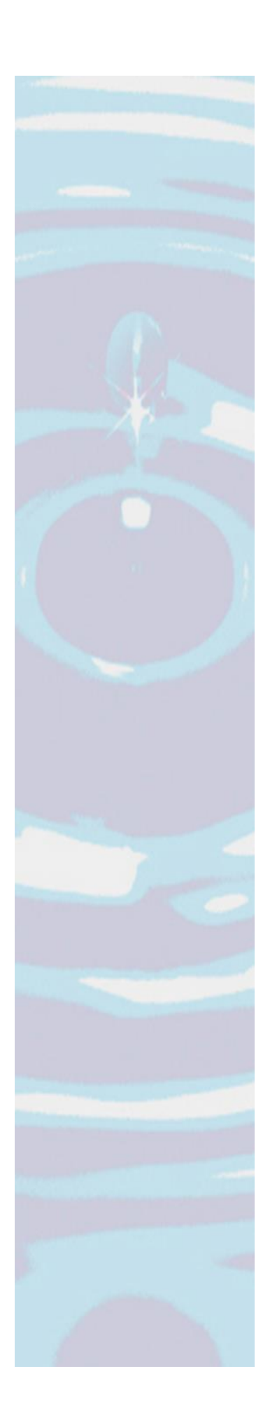
Section 2. Public Education