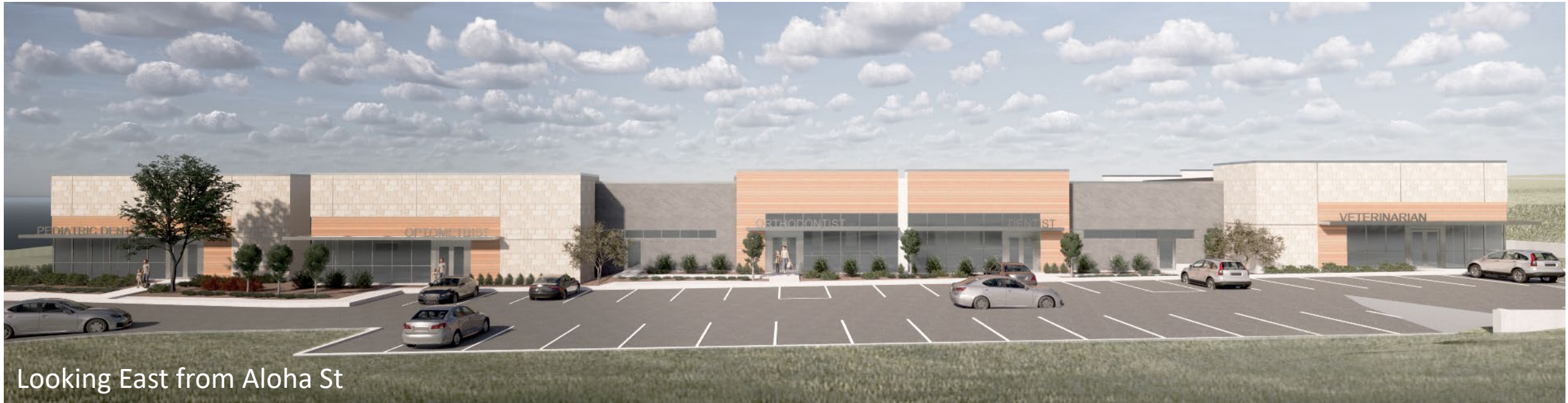
Looking East from Aloha St