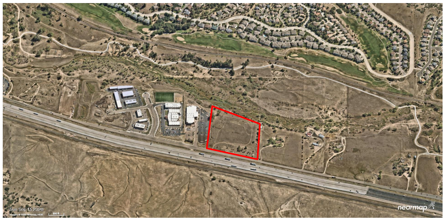
Figure 3: Aerial Image looking east on to the property

unincorporated Douglas County parcel that has a single family residence on it. To the north is Plum Creek Community Church. To the east of the property is a 7-acre open space property owned by the Town.