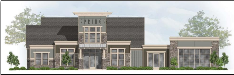
Clubhouse – Front Elevation

Walkability is an important characteristic of the Meadows Town Center. Although this development is gated at vehicle access points, pedestrians have direct access to and through the site. Pedestrians may enter the site from the public sidewalk at 12 points around the perimeter of the property (blue dash lines). An extensive network of walkways extend through the site. Adjacent neighbors and residents of the complex can conveniently traverse the site to reach the commercial center to the east, the Native Legend Open Space to the north and the school site to the southwest.