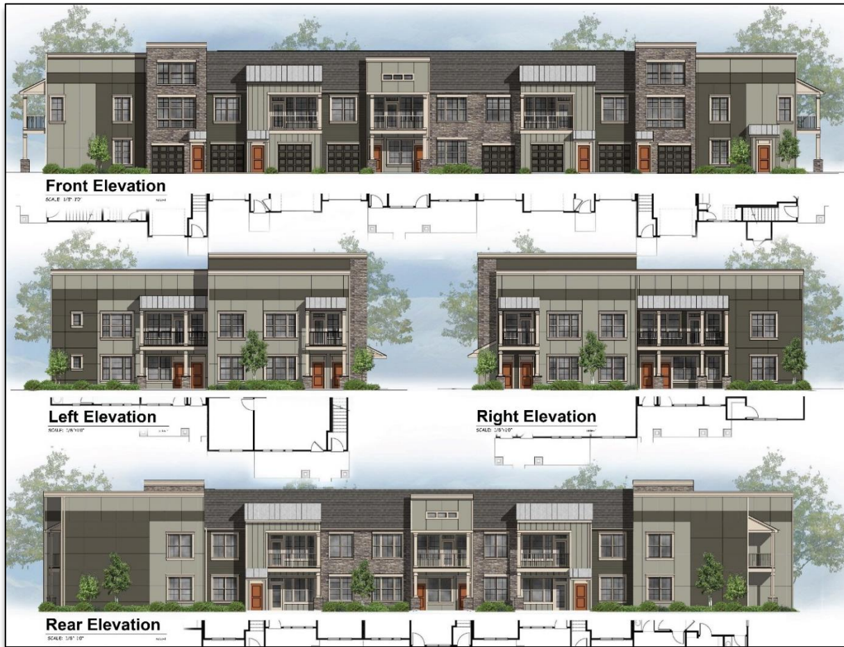
Apartment Buildings – Front, Rear and Side Elevations

Landscaping on the site exceeds the Town’s requirement of 20%. In addition, the streetscape proposed on the perimeter of the site meets the Town landscape criteria and will provide shade, buffers and visual interest.