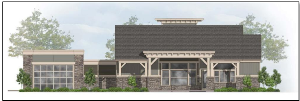
Clubhouse – Rear Elevation

Zoning standards require a minimum of 336 onsite parking spaces. A total of 367 onsite parking spaces are proposed, as a combination of attached and detached garages, private driveway spaces and surface parking lots. In addition, separate parking spaces are provided for the clubhouse and pool facilities.