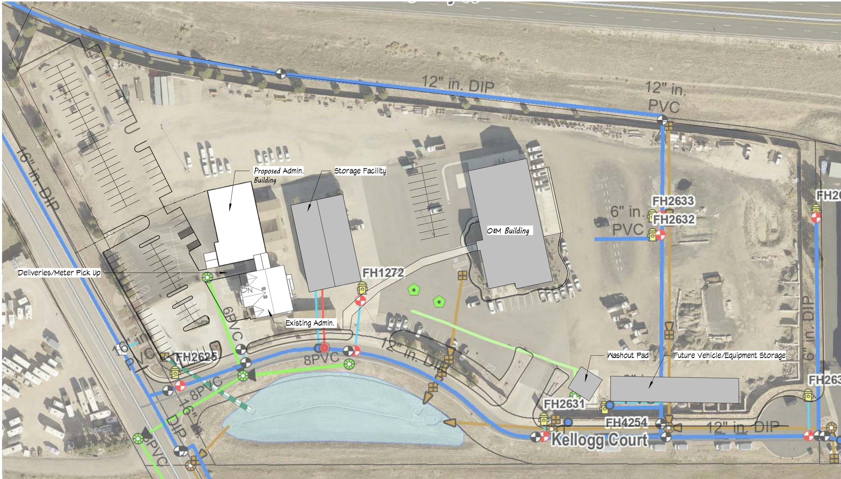
1 SITE PLAN A1 1" = 80'-0"