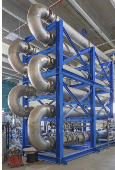
Ozone Contact Piping