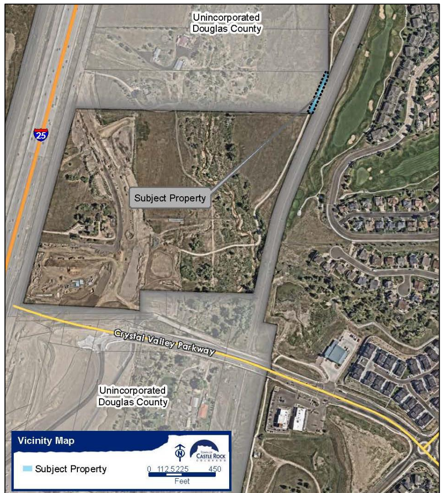
Figure 1: East Plum Creek Trail Vicinity Map

The parcel is currently zoned Agricultural One (A-1) in