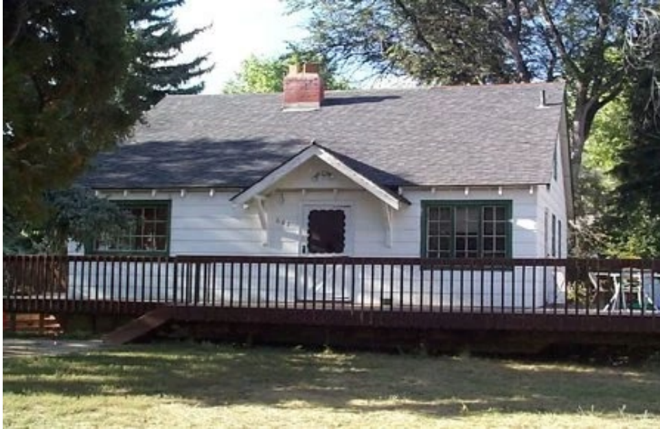
Photo of residence in ca. 2002.