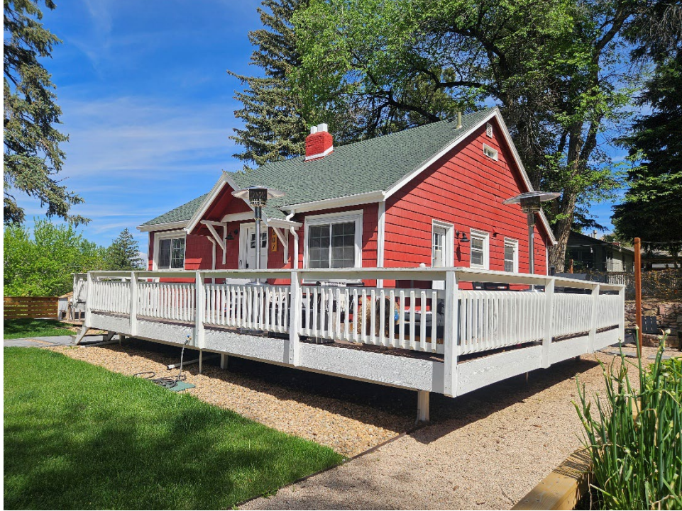
Primary (south) and east elevations of the residence, view northwest (Roll 26-450, image 103222; Emily Wren; 5/22/2026)