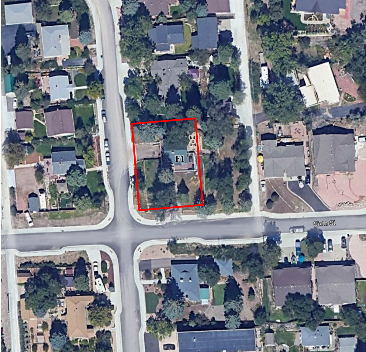
Map 3. Sketch Map of 607 Sixth Street, Castle Rock, Colorado, including rough parcel boundary; see Map 2 for official parcel boundary. September 2023 aerial imagery.