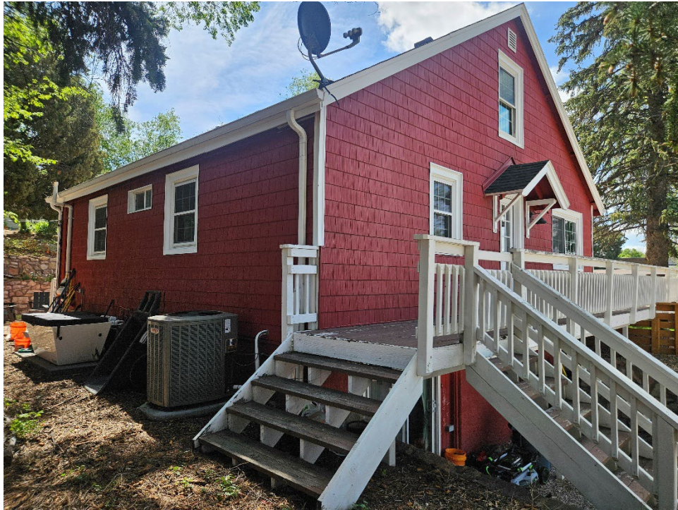
North and west elevations of the residence, view southeast (Roll 26-450, image 103316; Emily Wren; 5/22/2026)