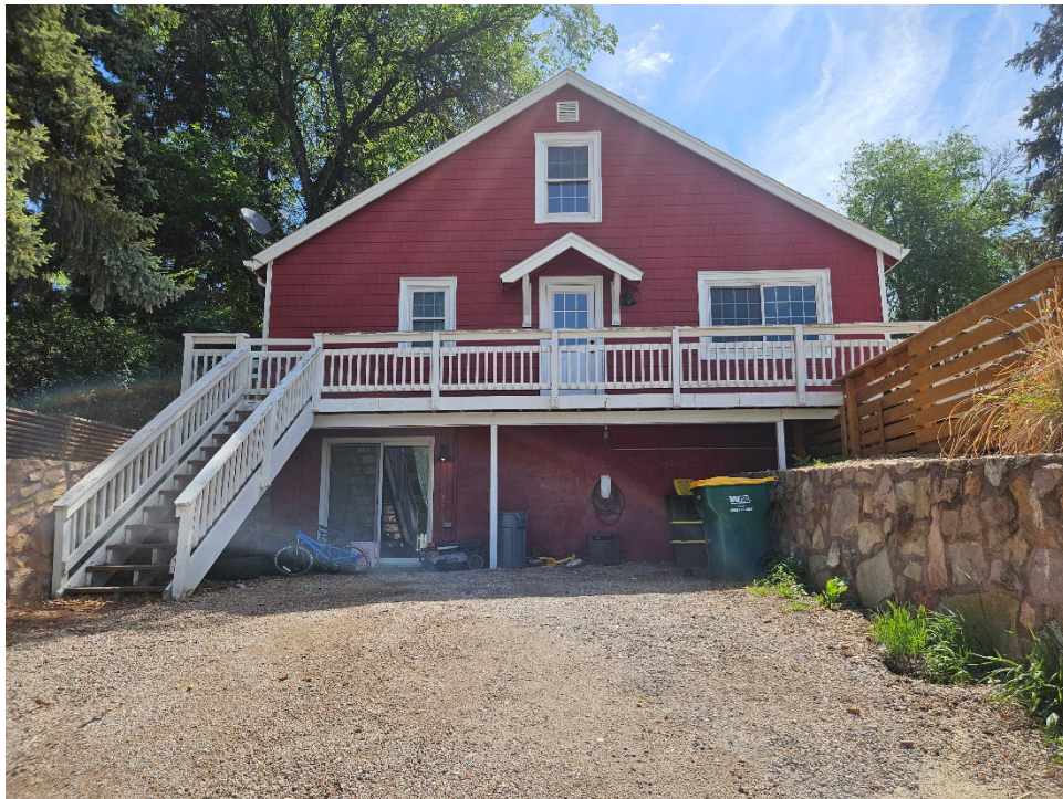
West elevation of the residence, view east (Roll 26-450, image 103504; Emily Wren; 5/22/2026)