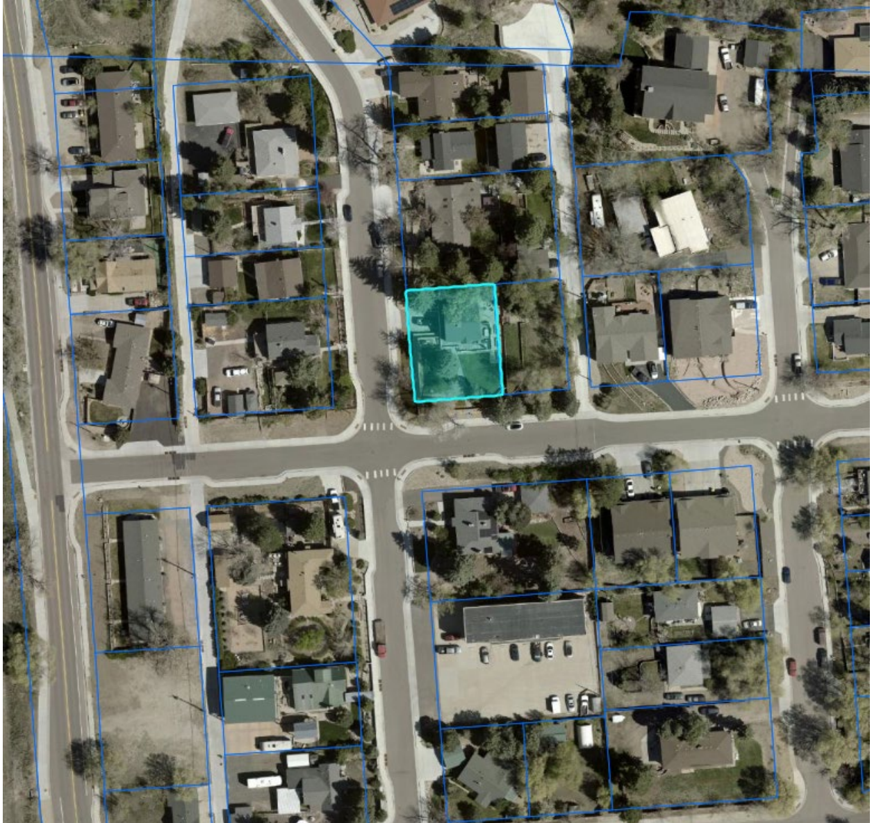
Map 2. Douglas County Assessor Parcel Map.