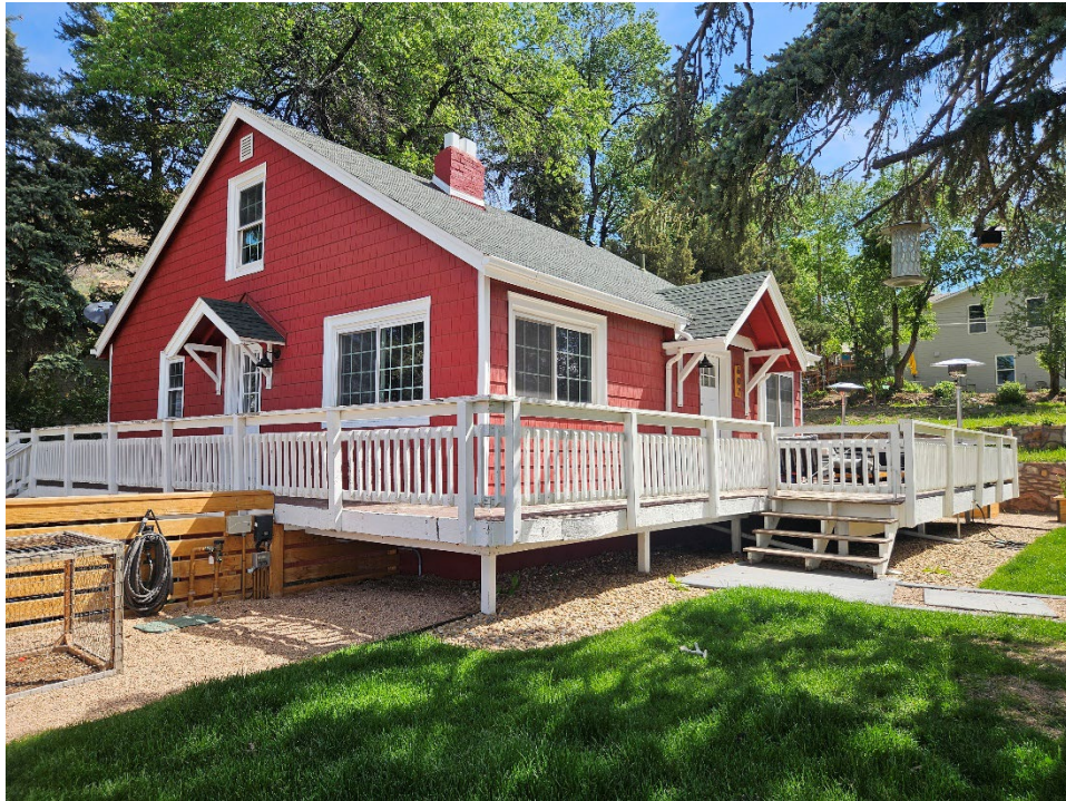
Primary (south) and west elevations of the residence, view northeast (Roll 26-450, image 103604; Emily Wren; 5/22/2026)