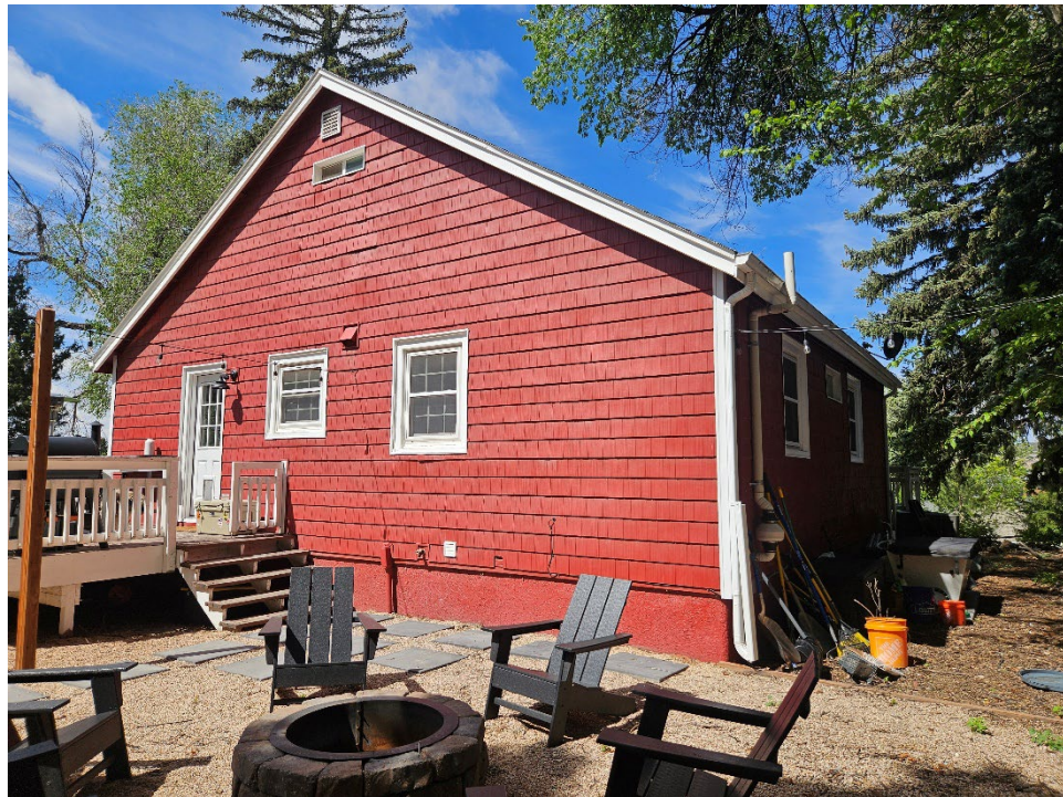
East and north elevations of the residence, view west (Roll 26-450, image 103249; Emily Wren; 5/22/2026)