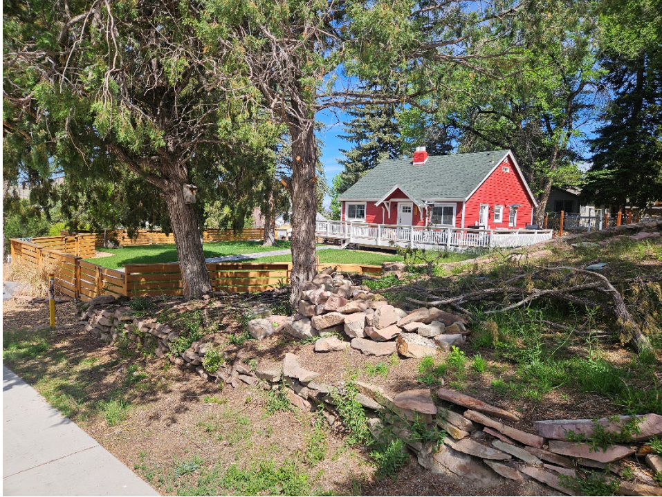
View of the property from the east adjacent parcel, view northwest (Roll 26-450, image 102945; Emily Wren; 5/22/2026)