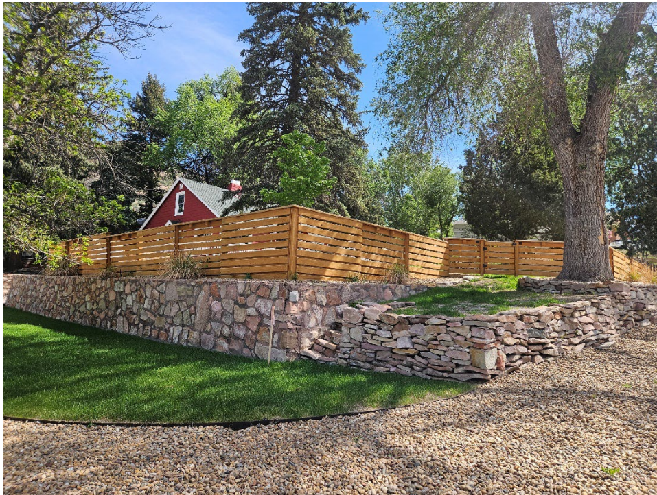
View of the property from the intersection of Sixth Street and Cantril Street, view northeast (Roll 26-450, image 103028; Emily Wren; 5/22/2026)