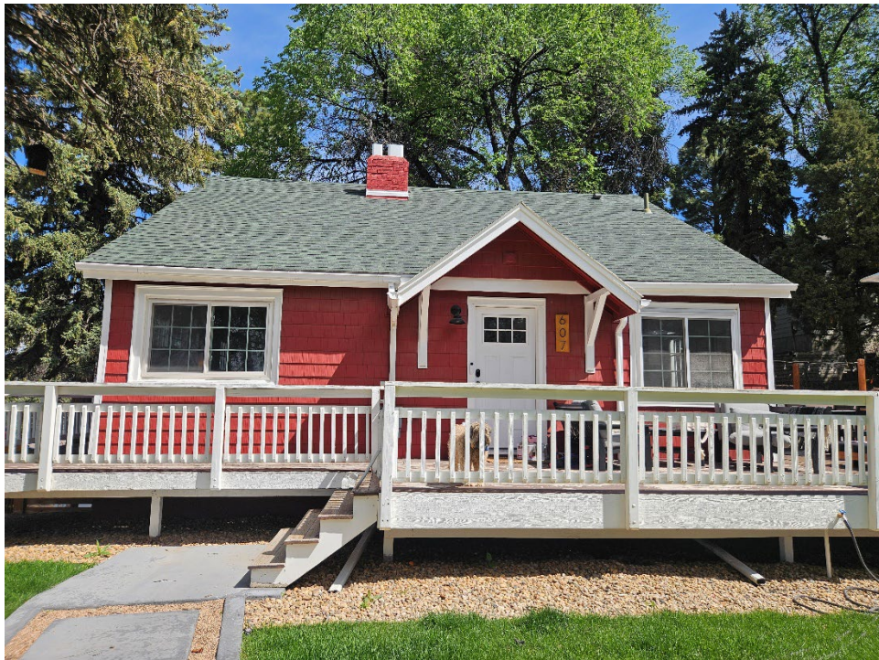
Primary (south) elevation of the residence, view north (Roll 26-450, image 103208; Emily Wren; 5/22/2026)