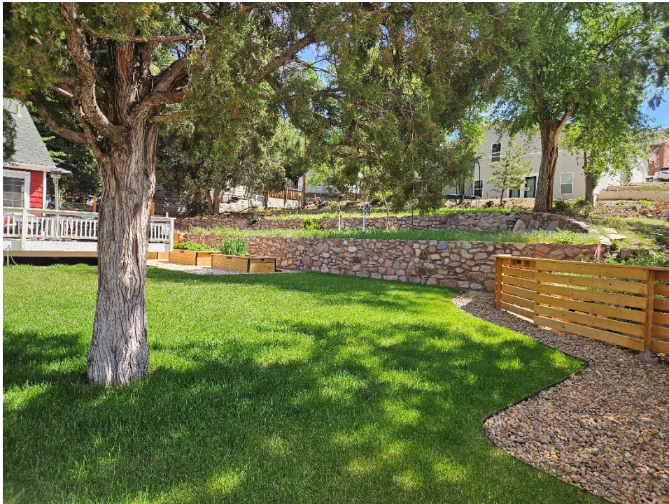
View of the front yard and terracing retaining walls on adjacent parcel, view northeast (Roll 26-450, image 103153; Emily Wren; 5/22/2026)