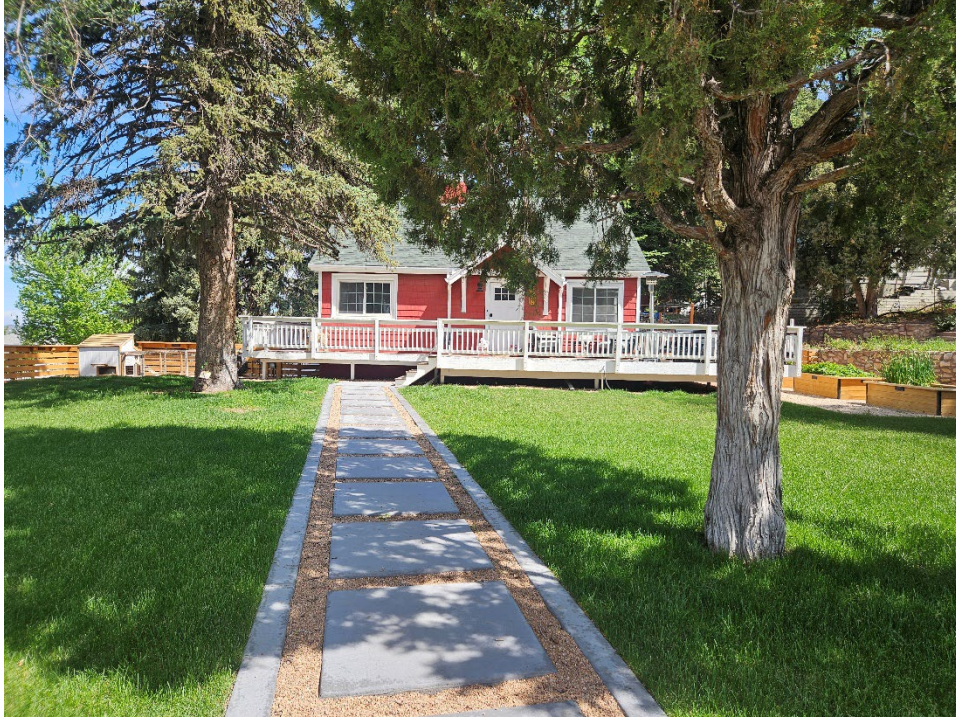
View of front yard and concrete pathway to south elevation of residence, view north (Roll 26-450, image 103150; Emily Wren; 5/22/2026)