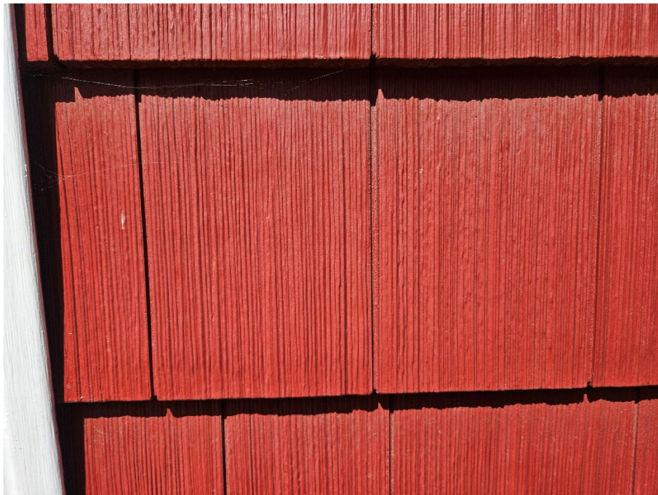
Close-up of the replacement shingle siding (Roll 26-450, image 103652; Emily Wren; 5/22/2026)

(Roll 26-450, image 103817; Emily Wren; 5/22/2026)