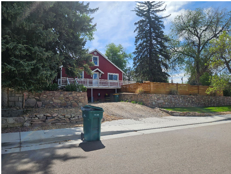
View of the property from Cantril Street at the northwest corner, view southeast (Roll 26-450, image 103100; Emily Wren; 5/22/2026)