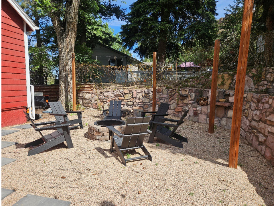
View of outdoor seating area, fire pit, and retaining wall on northeast corner of residence, view north

(Roll 26-450, image 103817; 5/22/2026)