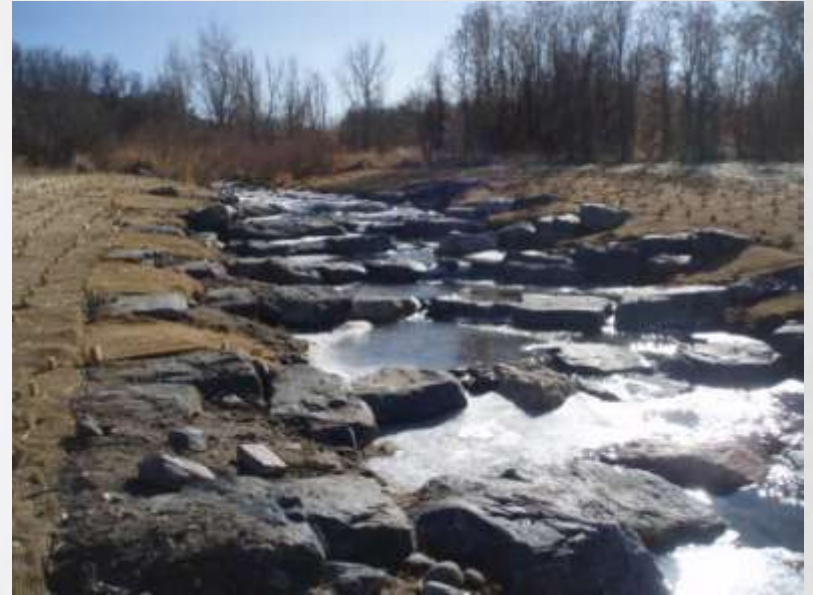
2020 COMPLETED PROJECT IMPROVEMENTS: MCMURDO GULCH PRIORITY 1 IMPROVEMENTS